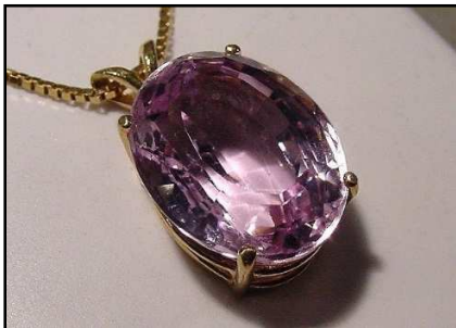
Kunzite

The Gemology Project is a top notch non-profit gemstone and gem science wiki-style database for anyone interested in gemstones and gemology. Every month they highlight a gemstone and a piece of gemstone identification equipment. Click on the topics at the top left for all kinds of useful information, too much to enumerate here. As customary we do not endorse the commercial GemologyOnline Marketplace offerings.< http://www.gemologyproject.com >